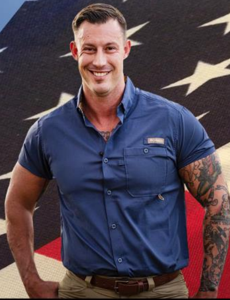
Johnny Joey Jones Great Speaker and Marine Veteran

Modesto Republican Women Federated Reagan Dinner Aug. 24th, 2023