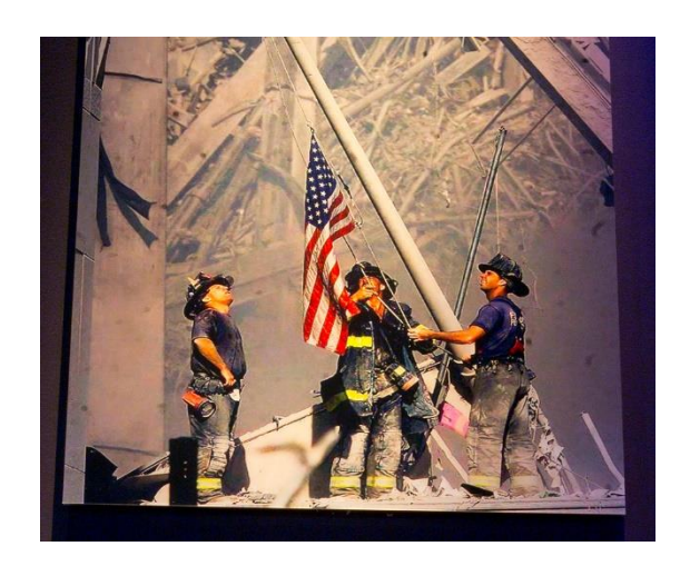
Remembering September 11<sup>th</sup>, 2001 (9/11) Also known as Patriot Day with the slogan Never Forget.

This is not a public holiday, but special events are held to commemorate the annual observance of the people killed in a coordinated terrorist attack carried out by al-Qaeda against the United States.